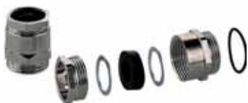
Pg cable glands MSS, brass, nickel-plated, IP 54