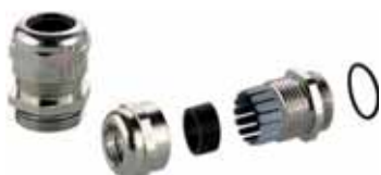
Metric cable glands MSBF, brass, nickel-plated, IP 68 (5 bar, 30 min)