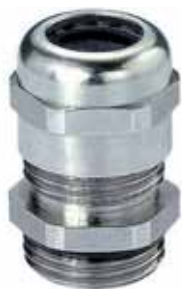
Metric EMC cable glands MEMV, brass, nickel-plated, IP 68 (5 bar, 30 min)