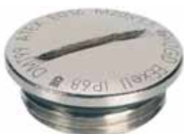
Metric EX blind plugs MBL-EX..MS, brass, nickel-plated