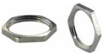
Metric counter nuts MGMS, brass, nickel-plated